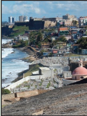
San Juan, Puerto Rico

Registration begins September 2. Register online, at calendar.skokiellibrary.info , or call 847-324-3149.